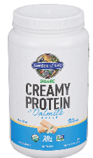
Garden of Life Organic Creamy Plant Protein with Oatmilk (selected varieties)