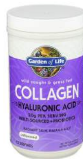
Garden of Life Collagen with Hyaluronic Acid