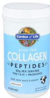
Garden of Life Grass Fed Collagen Peptides

Looking to up your protein intake? How about support for hair, skin, nails, and joints? Garden of Life offers just what you're looking for with clean, nutritious, and delicious protein and collagen choices tailored to your needs.