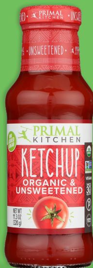
Primal Kitchen Organic Ketchup selected varieties