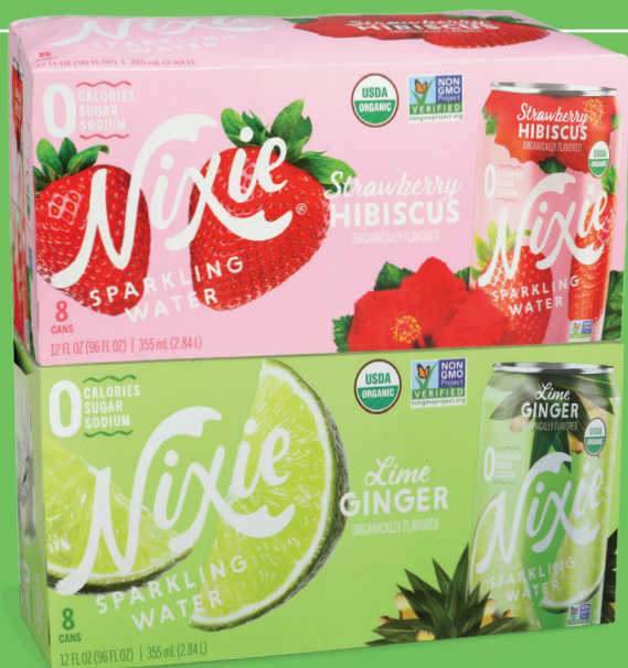
Nixie Organic Sparkling Water selected varieties