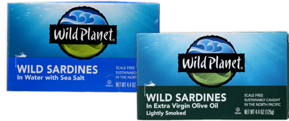
Wild Planet Wild Sardines selected varieties

Wild Planet uses the highest sustainable fishing methods to ensure our oceans provide for future generations. From catch to can, Wild Planet's minimal processing techniques and abundant care help maintain the purity nature intended so that we may provide you and your family with delicious, nutritious seafood you can trust.