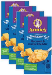
Annie's Mac & Cheese selected varieties