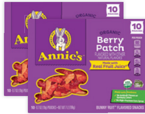
Annie's Organic Fruit Snacks selected varieties