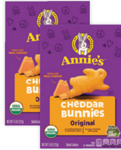
Annie's Organic Bunny Crackers selected varieties